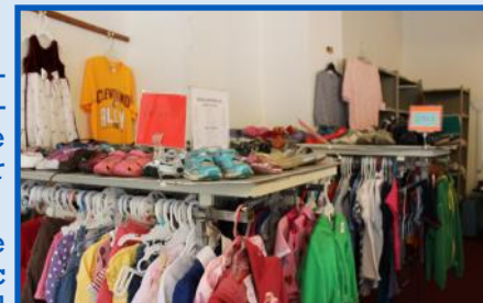
Partial view of resale shop

Always in need of additional items, Community Corner resale shop is located at 8302 Detroit Avenue and open weekdays from 10 a.m. to 2 p.m. For more information: (216) 631-6508.