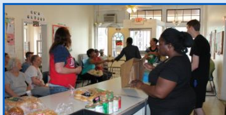
Clients receiving 3-day supply of food

Did you know that SVDP's Community Corner Food Center not only provides nourishment to poor individuals and families in Cleveland's Detroit-Shoreway neighborhood, but that it also offers clothing and household items through its resale shop? This Food Center was one of three that we acquired from the Center for Families and Children in April this year.